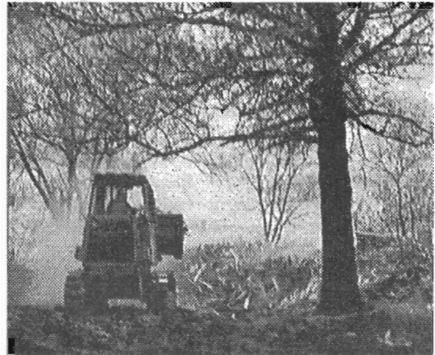
Another piece of Lenexa history was lost to the bulldozer April 20. The Rosner farmstead, a familiar landmark on the corner of 95th and Lackman for years, was destroyed to make way for development.