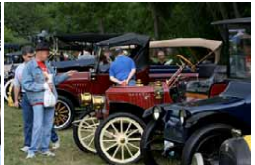
Back in time moment