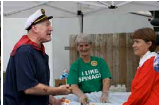
Popeye and his captivating laugh