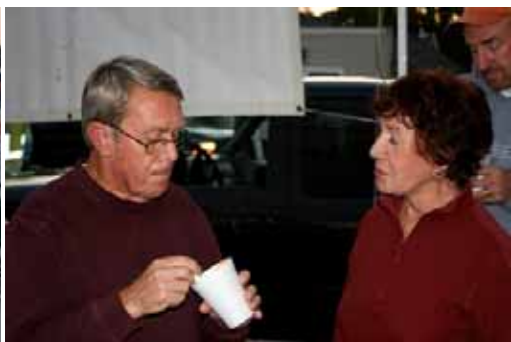
Mmmmmm! Good Chili