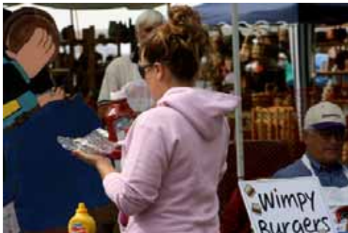
I've been waiting a year for this Wimpy Burger