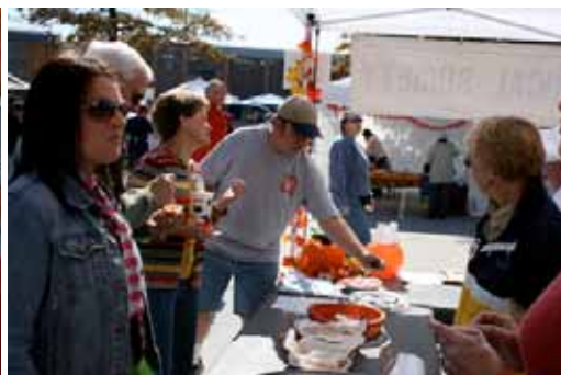
More samples of that #1 chili