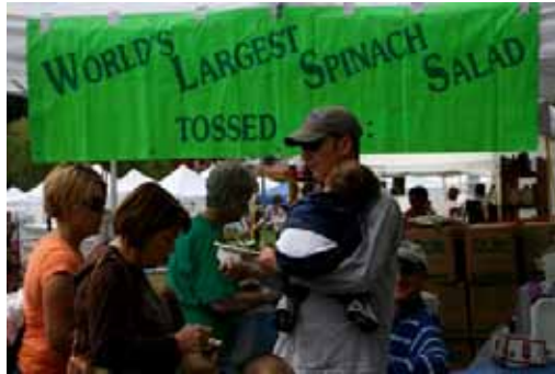
Let's see--How can I juggle a spinach salad & a sleeping boy?