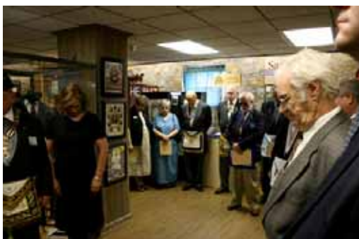
Moment of Silence