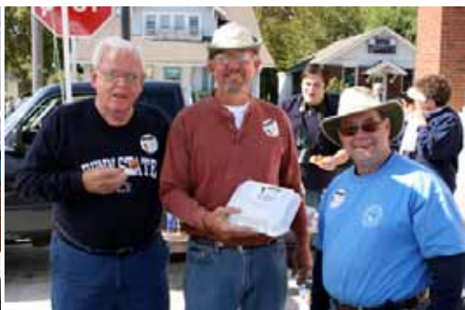
Hot Wings, Hot Wings, Hot Wings