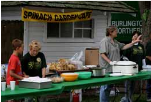
Spinach Garden Café getting ready to open