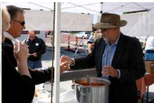
Here Try Some Of This #1