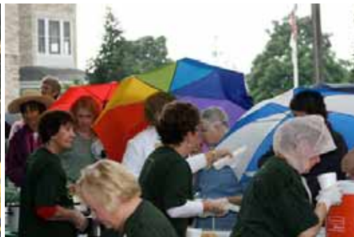
The Rain Came with a Sea of Color