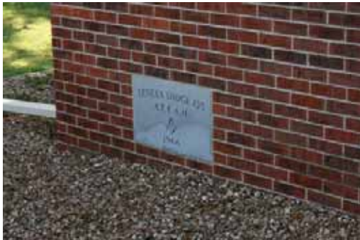
Re-dedication of the Lenexa Masonic Lodge