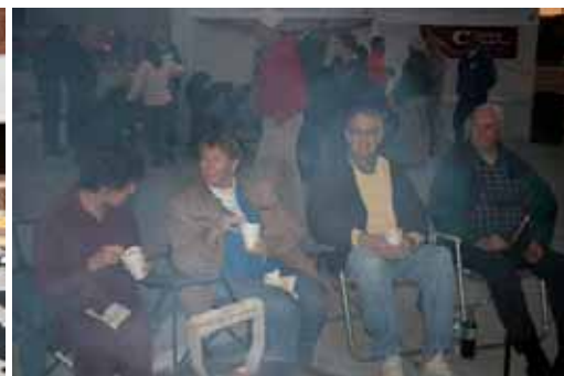
Smoke Gets In Your Eyes