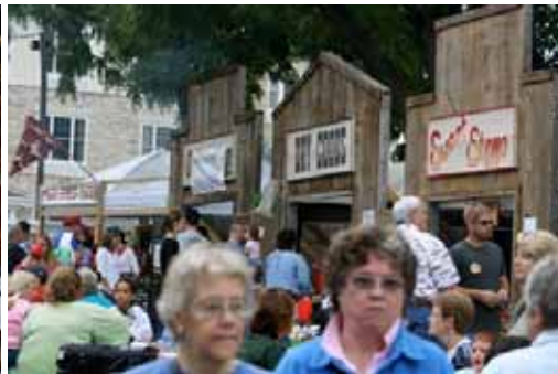
I just can't make up my mind. What do I want to eat?