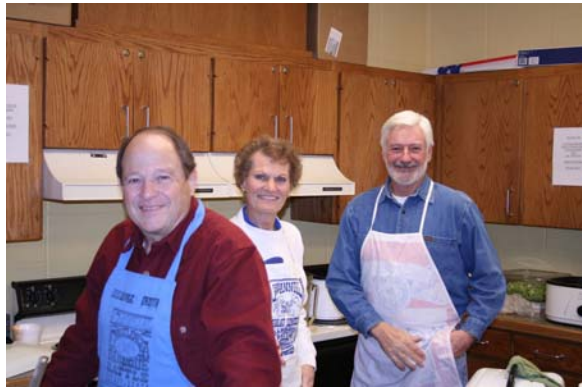
LHS Soup Luncheon Feb. 2011

See more pictures (and videos) online: http://lenexahistoricalociety.shutterfly.com/